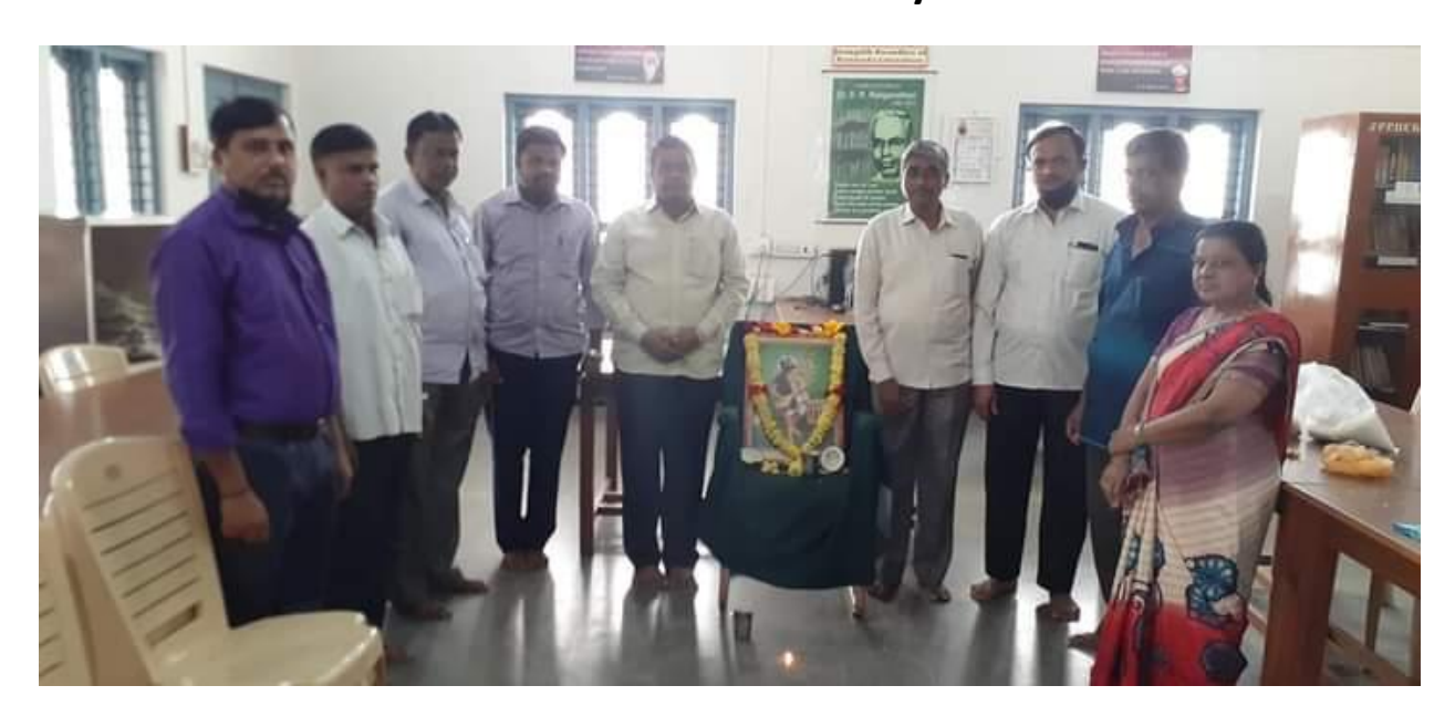
Celebration of Constitution Day