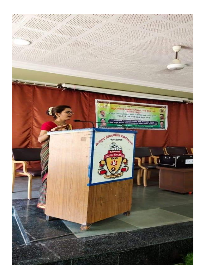
Students Participated in Inter College Singing Competition At J,T.College ,Gadag