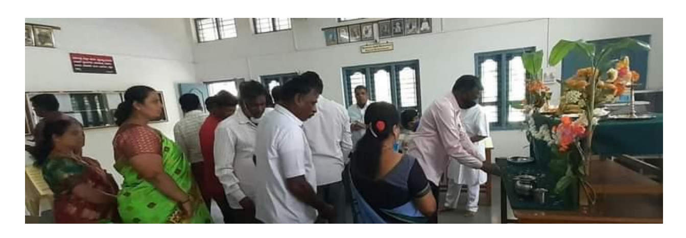
Celebration of Independence Day