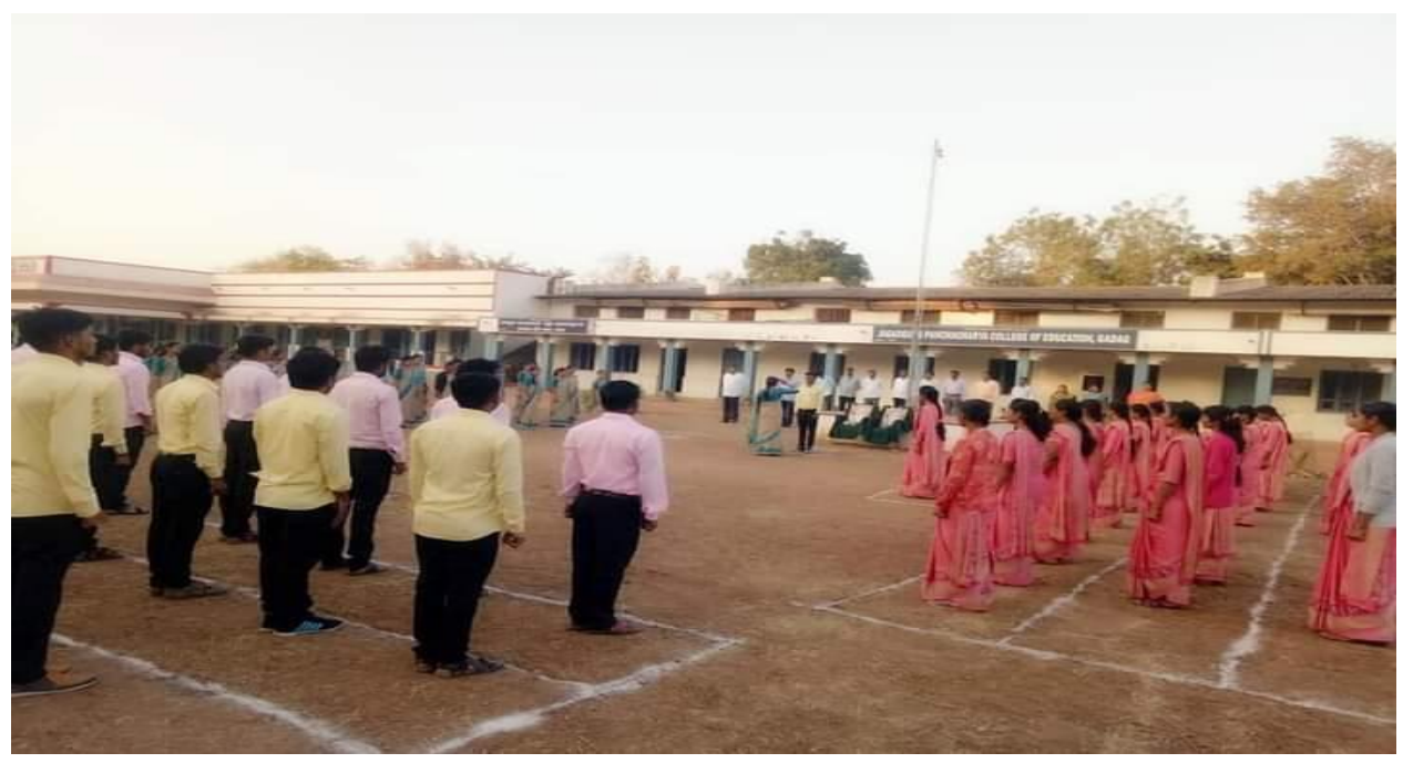
Celebration of Independence Day