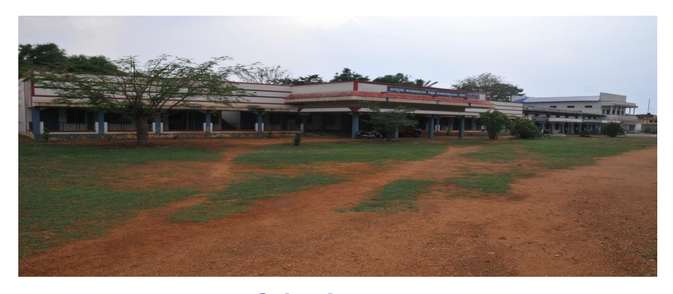
Criterion 6.3 Faculty Empowerment Strategies

Number of Professional development/administrative training programmes organized by the institution for teaching and non-teaching staff during the last five years.