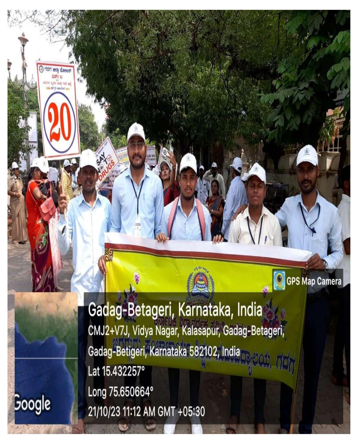
Students Participated in "Addiction free district" Rally.