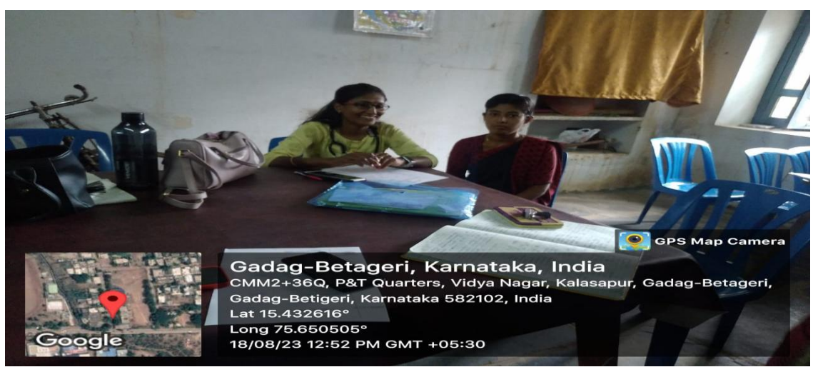
Health checkup of students by Doctors.